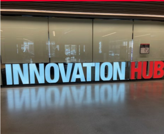
The downtown Carleton Dominion-Chalmers Centre (opposite page) and cross-faculty Innovation Hub (top, middle and above) help students and faculty connect and collaborate with community partners

CARLETON’S PURPOSE-BUILT INNOVATION SPACE AT KANATA NORTH’S HUB350 IS A NEW ECOSYSTEM WHERE INDUSTRY, FINANCE AND ACADEMIC PARTNERS WILL CONNECT AND COLLABORATE.