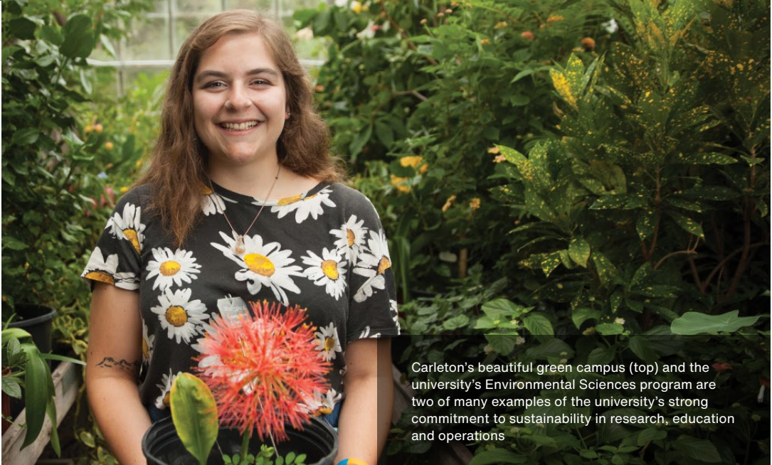
Carleton's beautiful green campus (top) and the university's Environmental Sciences program are two of many examples of the university's strong commitment to sustainability in research, education and operations

IN UI GREEN METRIC WORLD UNIVERSITY RANKINGS OF THE MOST SUSTAINABLE UNIVERSITIES IN ONTARIO AND STARS GOLD RATING FROM AASHE