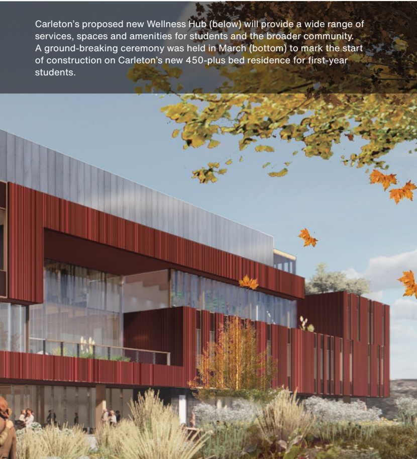
Carleton's proposed new Wellness Hub (below) will provide a wide range of services, spaces and amenities for students and the broader community. A ground-breaking ceremony was held in March (bottom) to mark the start of construction on Carleton's new 450-plus bed residence for first-year students.

campus. This state-of-the-art, 180,000-square-foot facility will showcase an amenity floor that includes study, social, fitness and cooking spaces for the entire residence community. This building uses the fundamentals of passive house design and will serve as a beacon as community members come onto campus. It's expected to be completed in 2024.