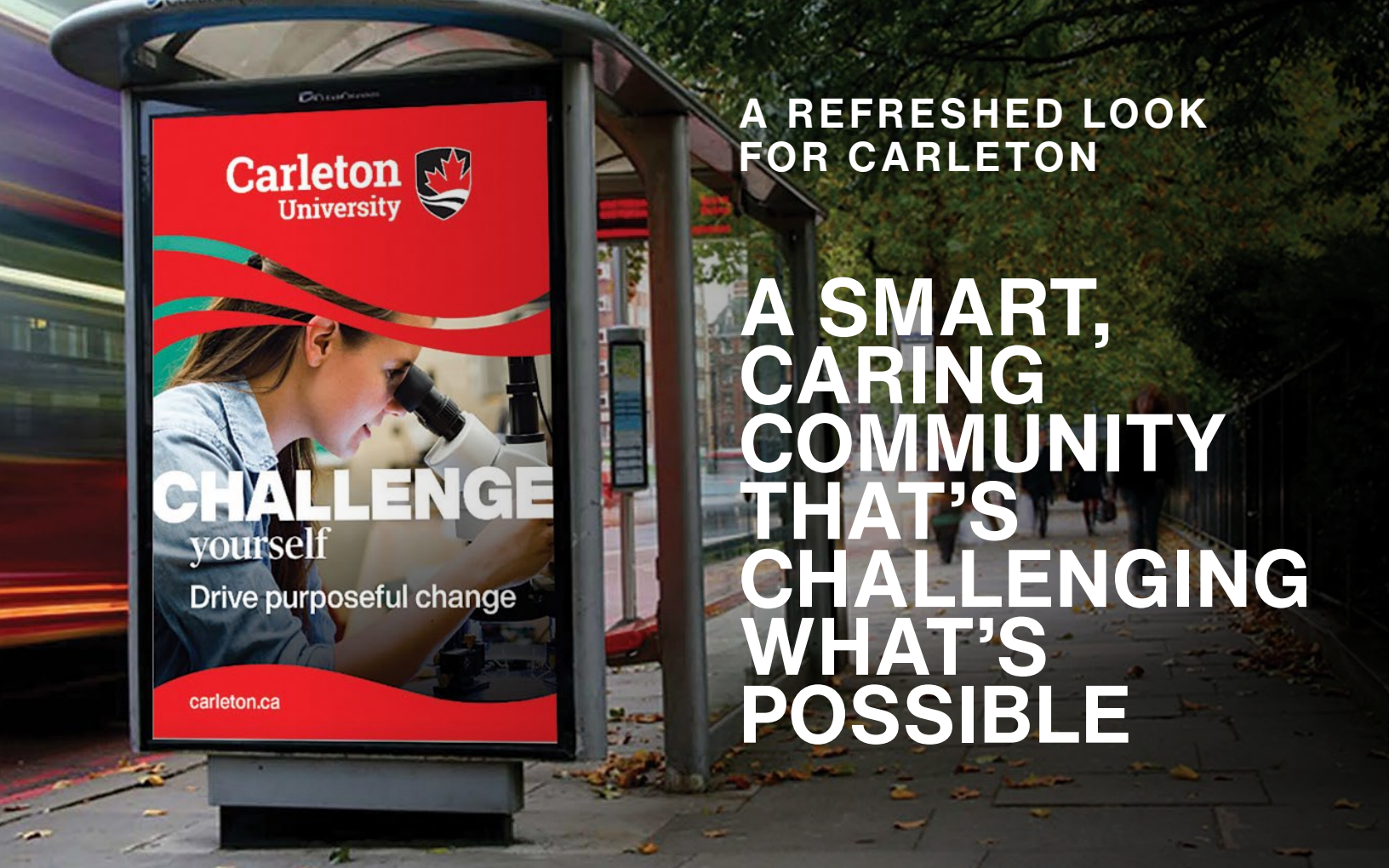
The national, multi-channel CHALLENGE campaign (above and below) uses compelling messages to create emotional and intellectual connections to Carleton